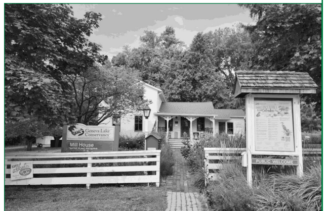
Geneva Lake Conservancy's headquarters, the "Mill House."

Your donations, in-kind gifts, and general support makes a lasting impact on the lands and waters that define our community. You can make a financial donation online at GenevaLakeConservancy.org or use the QR code on the right. Thank you!