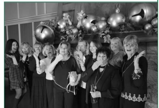
Last year's Holly Ball 'Silver Bells' was a wonderful night!

This year's gala will dazzle under the theme “Holly Ball Goes Hollywood,” reflected in the elegant décor, entertainment, and ambiance of the evening. We invite guests to join the celebration by dressing in Hollywood-inspired attire. The Conservancy invites you to set aside this evening to celebrate and support conservation efforts in Walworth County. Use the QR code to register or visit GenevaLakeConservancy.org .