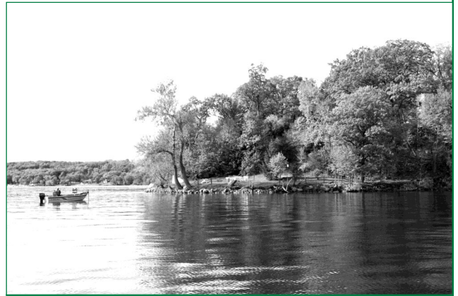
Geneva Lake

In addition, the Geneva Lake Conservancy and its partners will host a public meeting to present the plan and answer questions and solicit comments on Thursday, November 20, 2025 from 5-7 PM at Chapel on the Hill, N2440 Ara Glen Drive, Lake Geneva.