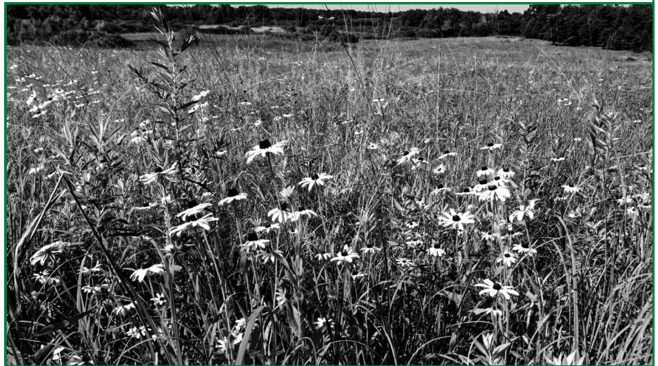
Yellow coneflowers grace the Zabler Farm prairie .

The Conservancy will continue to manage it as a private preserve with educational tours and fundraising events for the public at least four times a year. Howard and Bev Zabler continue to own the adjacent 16 acres that include the farmhouse, barn and other buildings. When the Zablers vacate that property, the 61 acres will be open to the public for hiking and wildlife viewing.