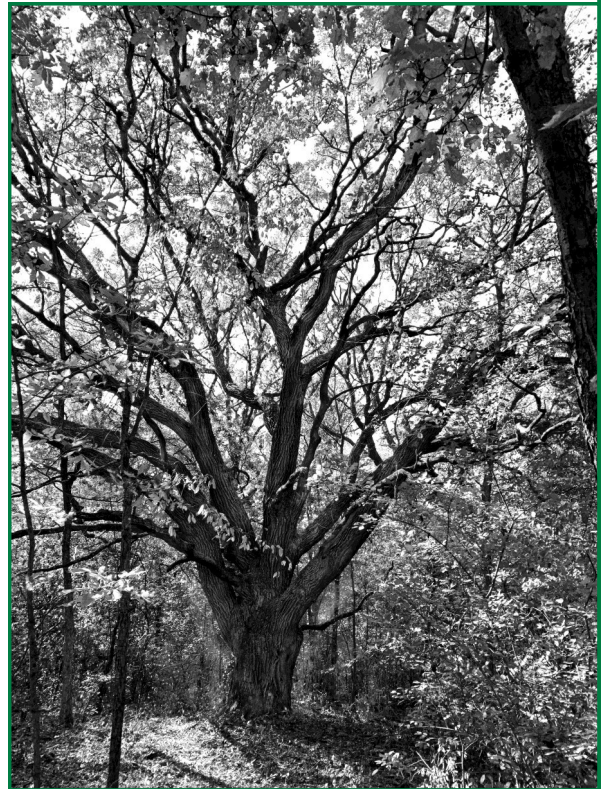
John Zinzow, utilizing the oak aging chart used by the Morton Arboretum, estimates that this stately oak tree in the Kettle Moraine State Park is 350 year old.

John estimates that he spent 30-35 hours clearing non-native brush that almost completely blocked a view of the tree from the main trail.